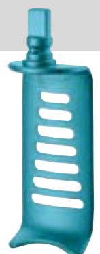
cranial-caudal blades (blunt)