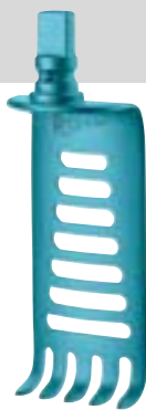
medial blades (large teeth)